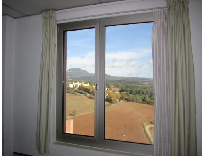
Figure 1: Hospital de Terrassa: windows replacement

As scheduled, part of the retrofitting works to be carried out in Hospital de Terrassa in the frame of RESSEEPE project was finished. Regarding the energy efficiency measures for the improvement of the envelope, a total of 60 old windows were replaced by high efficiency windows on 3 hospitalization wings on the 8th and 9th floors. The old windows were single-paned with aluminium frames without thermal breaks. The new windows are argon-filled double-glazing with low emissivity and solar protection, and with aluminium frames with thermal breaks. In addition to energy losses reduction achieving, user comfort was improved.