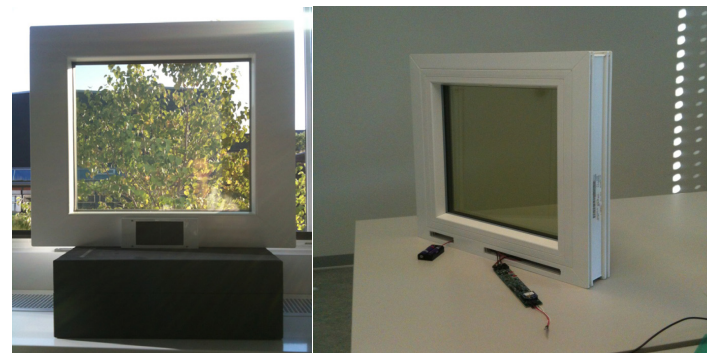
Figure 3: Integration of the EC window, battery and window's control unit

The integration of the EC window, battery and window's control unit has been performed through a PVC frame. It hosts the electronic components and provides access through the rear part of the window. It was designed under accessibility requirements in case of electric failure such as faulty batteries that need a replacement or reset the electronic. Figure 3 shows (left) the wiring configuration of electronic components and (right) the final assembly and appearance of the prototype, where the PV module is attached to the front side. Its wires are accessible from the rear part where the electrical connection to the electronic board is also performed. In conclusion, the final design and assembly of the PV powered EC window prototype is successfully implemented. Optimization of the configurations and long term performance analysis under outdoor conditions will be performed within Task 5.9: Testing of renovation solutions at lab scale.