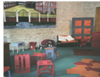
Les tabourets, les fauteuils, les rangements...