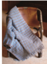
Les couettes, les matelas, les futons, les oreillers, les couvertures.