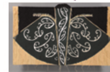
Les tapisseries murales