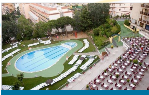
Figure 1 demEAUmed demonstration site (Samba Hotel)

alternative swimming pool water disinfection (five technologies: Smart Air MBR, VertECO, Plimmer, UVOX, SPEF) are being finalized and provided long term characterization with high efficiency for organic compounds, solids, for nitrification and many micro-pollutants.